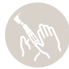
CONTROL AND MAINTENANCE